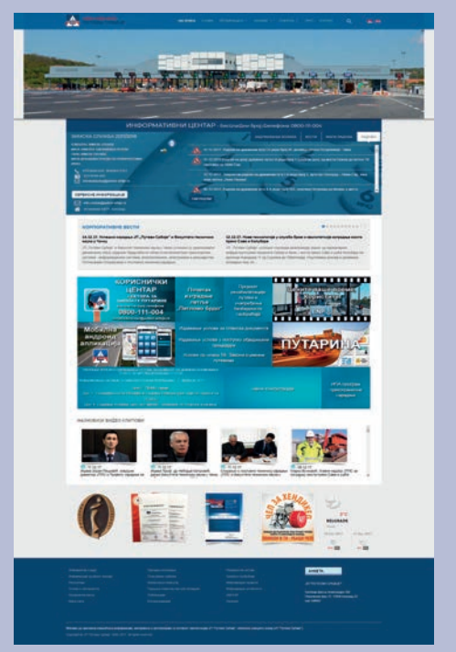
Internet presentation of PE "Roads of Serbia"

The PR Department is actively involved in a wide range of activities within the scope of its work and one of its responsibilities is the internet presentation of the Company, which is expected to record over 650,000 visits and over 1,200,000 page views by the end of the year.