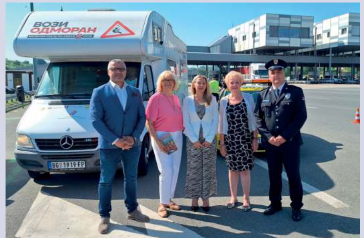
Promotional and educational activities aimed at domestic and transit passengers were organized at the Stara Pazova and Belgrade toll stations, with the aim of reducing the number of traffic accidents caused by fatigue".