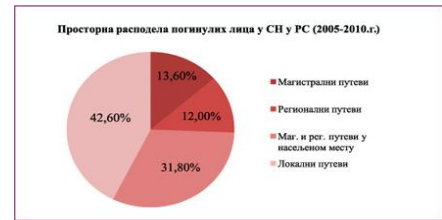
Picture 3. Spatial distribution of persons killed in traffic accidents in the Republic of Serbia (2005-2010)