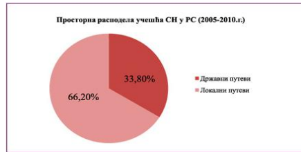
Picture 2. Spatial distribution of traffic accidents participation in the Republic of Serbia (2005-2010)